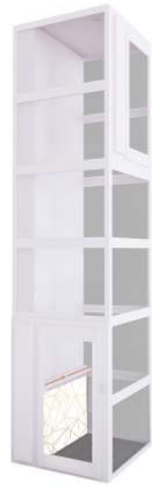
RAL 9010 - Pure White