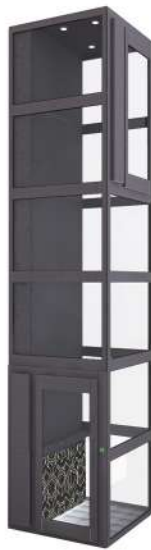
DB703 - Dark Grey