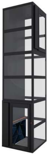
RAL 9005 - Black