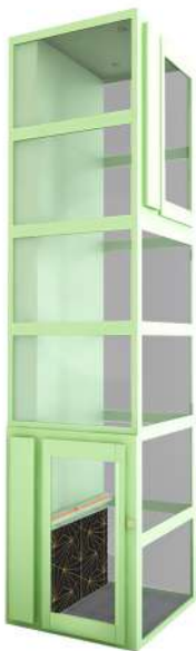
RAL 6021 - Pale Green