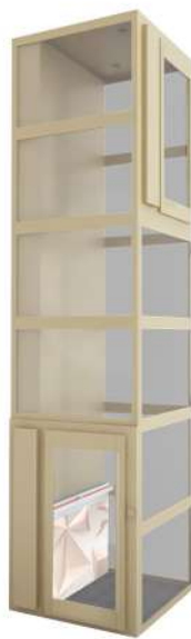
RAL 7008 - Khaki grey