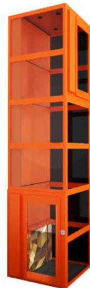
RAL 2003 - Pastel orange

*See More Detail Ral Colors (RAL Brochure)